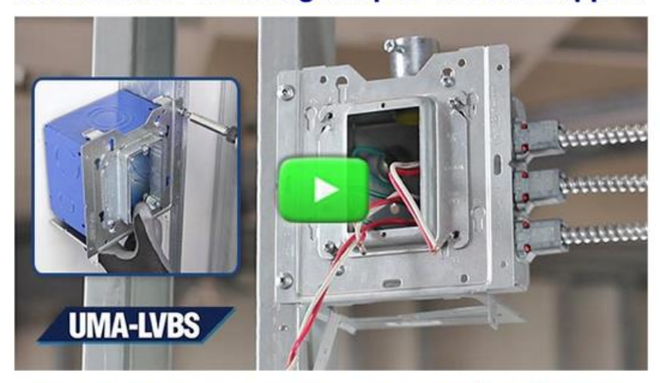
Mount 4". 4-11/16" and 5" boxes direct-to-stud with the Universal Mounting